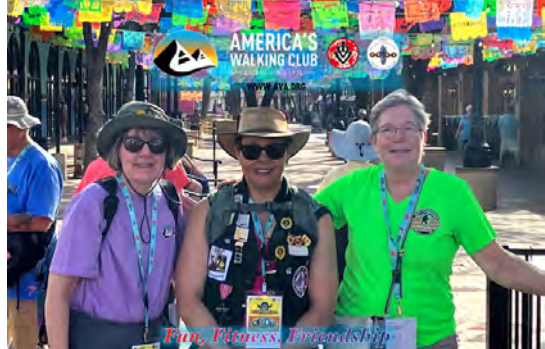
Click here for Photo Contest Rules

Entries are due to AVA National office no later than August 31, 2024. Rules, guidelines and the official entry form are attached in link below. Participation in the nationwide contest is open to AVA members, clubs and state organizations. All entries must have been created or occurred during the time period from July 1, 2023 – August 31, 2024. For more information contact Hector at hector@ava.org.