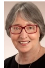
The Honorable Linda Langerhans Mayor , Fredericksburg TX